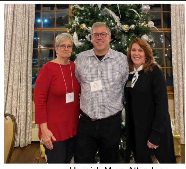
Harwich Mass Attendees