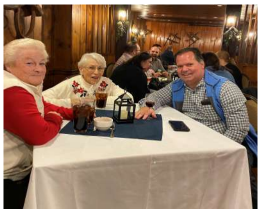
Great ability to Network!