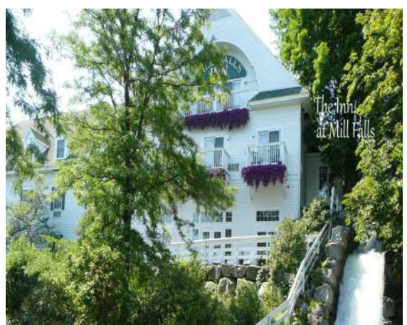
Annual Meeting Site June 2022 Materials will come out in the spring of 2022