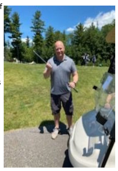
Spouses and Guests Program Group: Next stop the Hermit Woods Winery