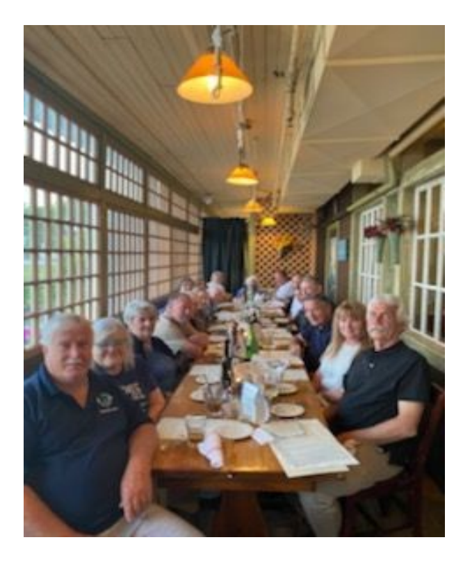
Good Friends and Company after a few years of absence— Thank you COVID