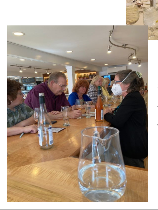
Spouse & Guest Program – Wine Tasting and Tour – Hermit Woods Winery in Meredith NH