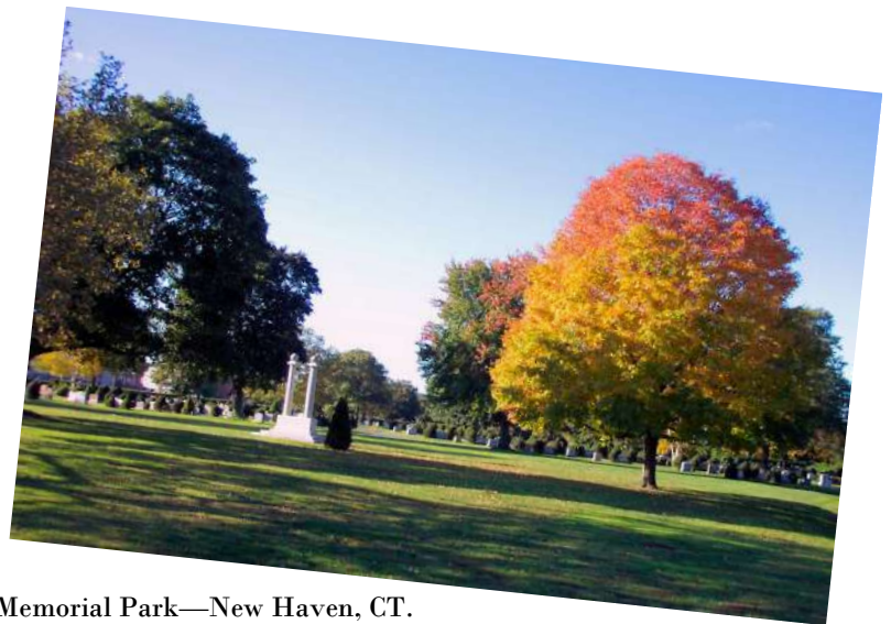
Beaverdale Memorial Park—New Haven, CT.