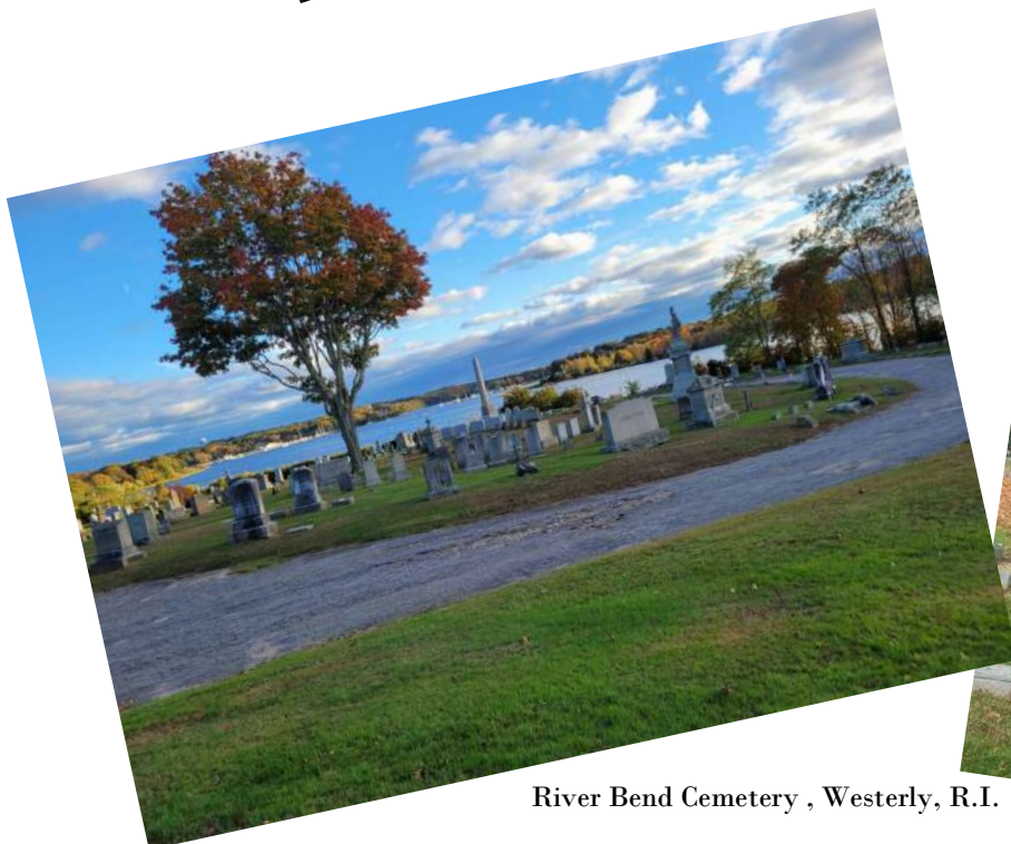
River Bend Cemetery , Westerly, R.I.