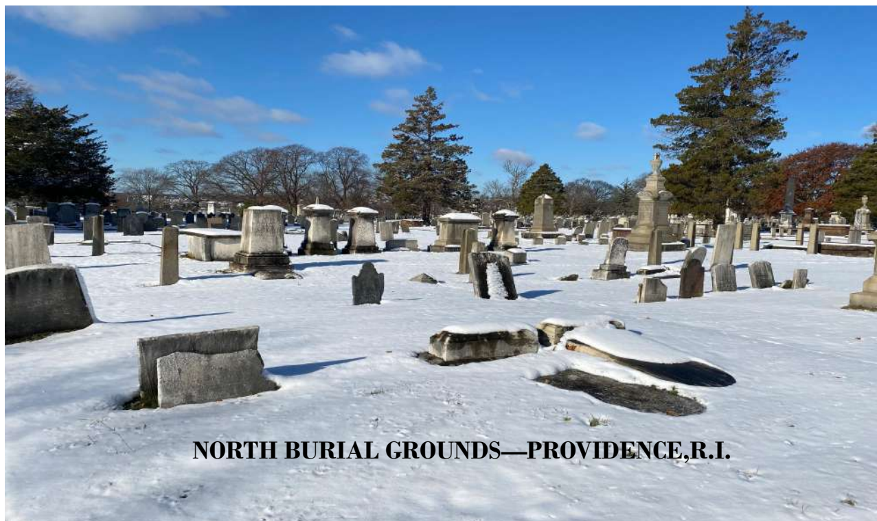
NORTH BURIAL GROUNDS—PROVIDENCE, R.I.