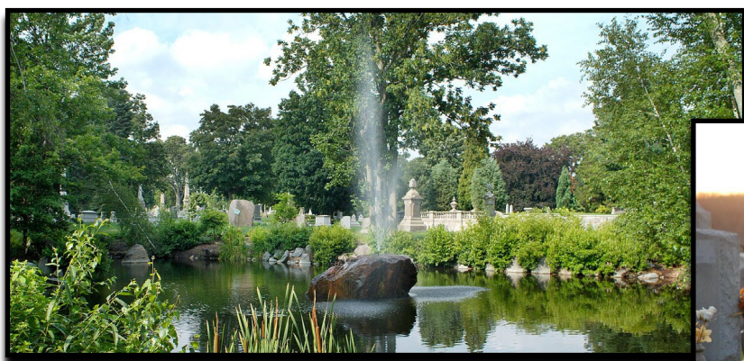
Swan Point Cemetery